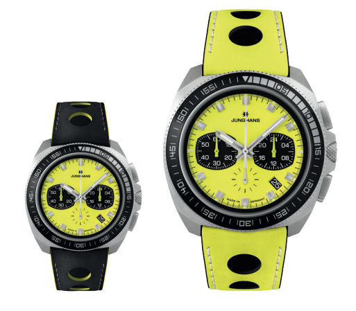
1972 Chronoscope Quarz Edition FIS Lemon

With the 1972 Chronoscope, winter sports fans can always keep track of run times thanks to its unidirectional turning bezel and the stop function accurate to 1/5th of a second. The leather straps with large cutouts allow for quick release – similar to the ski change on mass start distance races in cross-country skiing – for a time-saving exchange of material.